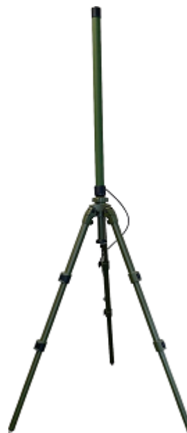
Tripod with antenna