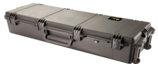
Antenna and tripod suitcase

Includes cables power supply, cigarette lighter, USB and antenna.